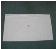
Standard Sealed Bag